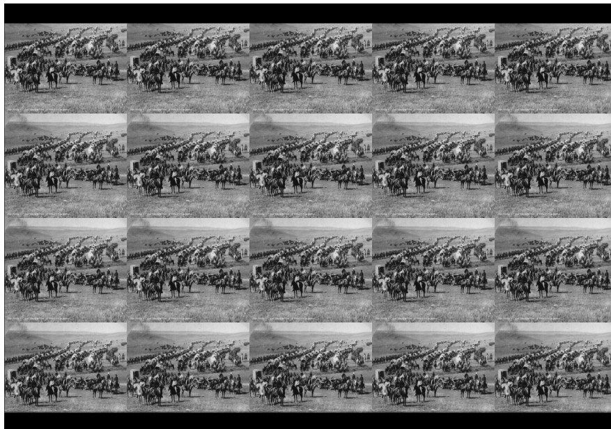
General George A. Custer, Dakota Territory, 1874 Black Hills Expedition

Congress on Recess: Congress is on spring recess and will be home in their district offices for the next two weeks, they return to Washington April 12. Now is the best time to visit them and discuss the health care reform law as well as all of our legislative priority goals - let them know that you expect them to do the right thing by our veterans and service men and women.